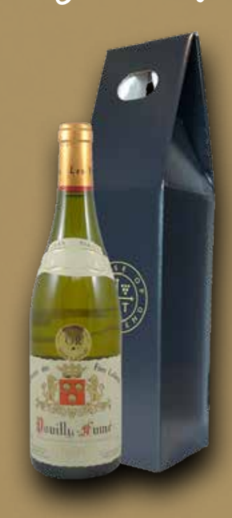
POUILLY FUMÉ PABIOT FRANCE GIFT460 £19.99