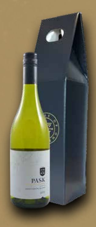
PASK SAUVIGNON BLANC NEW ZEALAND GIFT455 £13.99