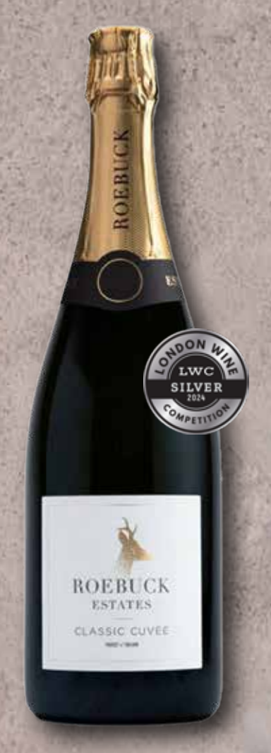
1. ROEBUCK ESTATE CLASSIC CUVÉE ROEB001 WAS £37.99 - NOW £32.99