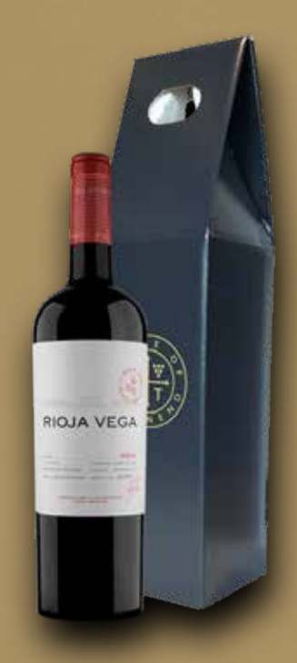
RIOJA VEGA LIMITED EDITION CRIANZA - SPAIN GIFT465 £14.50