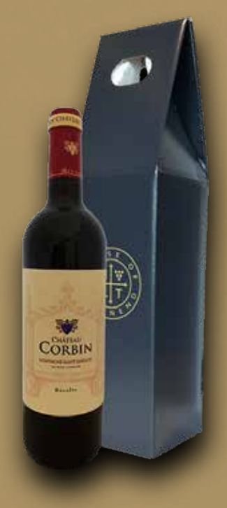
CHATEAU CORBIN FRANCE GIFT470 £16.99