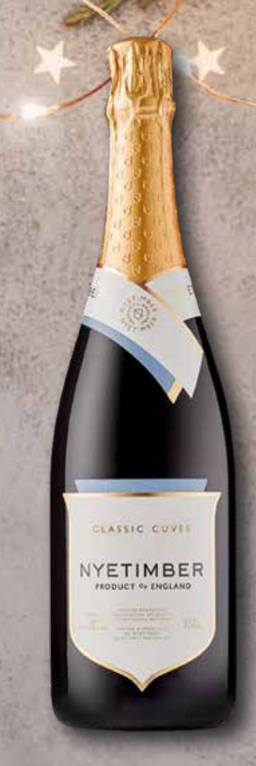
3. NYETIMBER CLASSIC CUVEE NYET001 WAS £39.99 - NOW £29.49