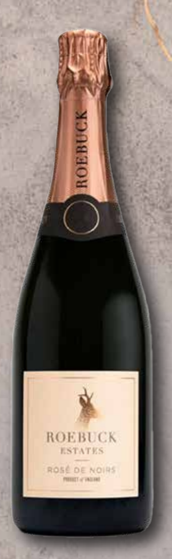
2. ROEBUCK ESTATE ROSÉ DE NOIRS ROEB005 WAS £42.99 - NOW £38.99